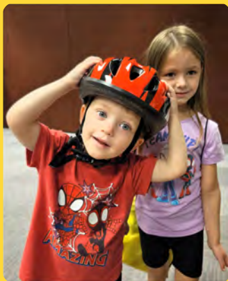
Right: A brother and sister who received new helmets