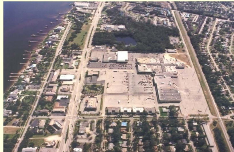
Sunshine Park Mall Property

The mall has a new director of commercial properties and the City will continue to work with the mall owner/staff to identify development opportunities in which we can partner. Major renovations for a Town Center are still on hold but the owner is planning on some smaller scale renovations and upgrades to the mall as the economy allows.