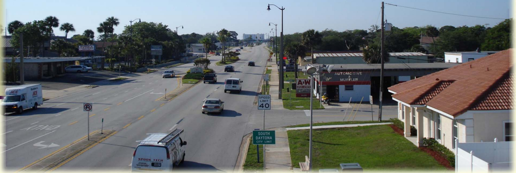
US1 Streetscape Project: Section A Beville Road to Big Tree Road Phase I – Undergrounding of Utilities/Decorative Lighting