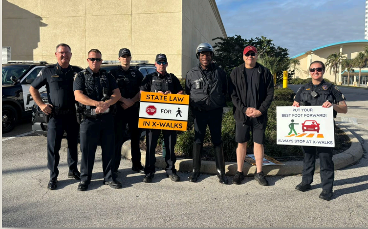
Daytona Beach Shores