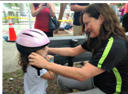
1 Port Orange Family Days