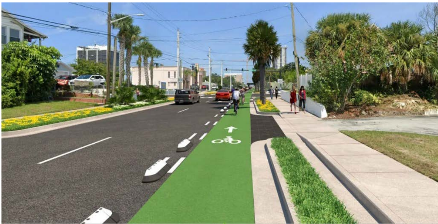
Rendering of Oakridge Boulevard in Daytona Beach, FL facing east.

TPO and FDOT staff will provide an overview of Zipper Bicycle Safety Systems.