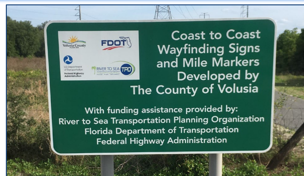
Coast to Coast Trail at Gemini Springs Park Signage